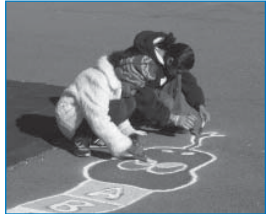
Leaders in the Making students in a beautification project.