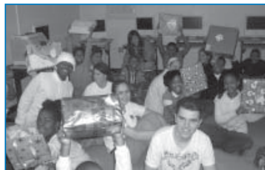
Bunker Hill Elementary Students with Holiday Gifts

AFP/DC Metro Area Chapter D.C. Children & Youth Investment Trust Corp. Japan Commerce Association of DC World Bank Community Connections Fund CSC-Assoc. of Administrative Professionals International Dairy Foods Association International Monetary Fund Kiwanis Club of Northeast Washington NASFAA Nelnet Washington Golf Charities, Inc.